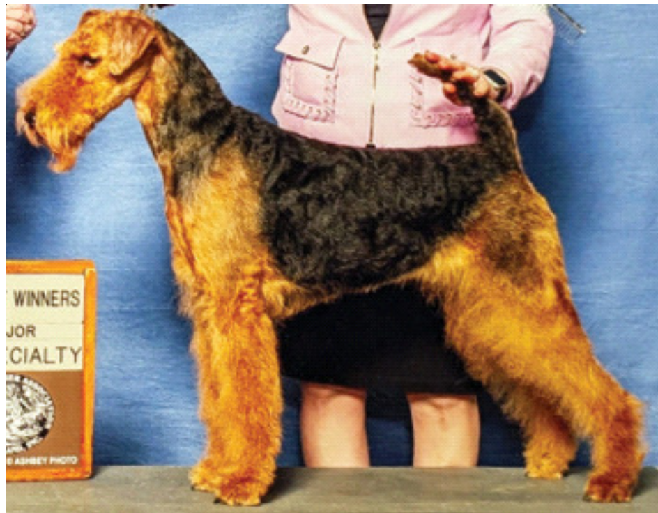
Winners Bitch and Best of Winners TRAYMAR'S PEANUT BUTTER BANDIT