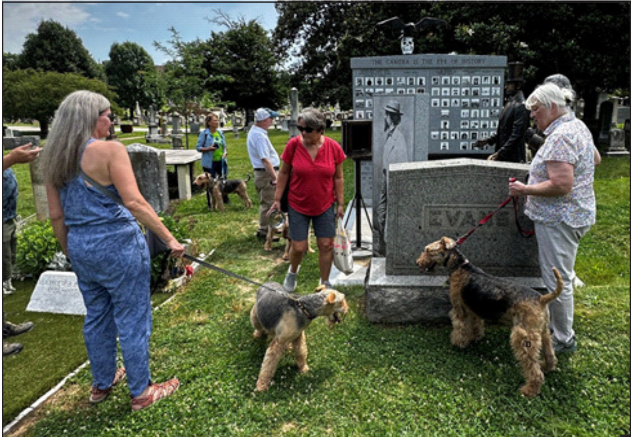
ATCMW members with their dogs at the Brady memorial, Congressional Cemetery.