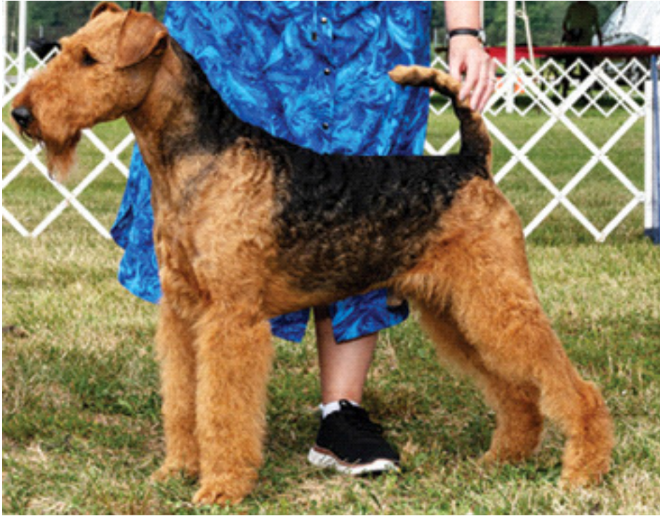
Best of Opposite Sex CH GLENROYAL HIGHLAND LAD OF HOLLYBRIAR