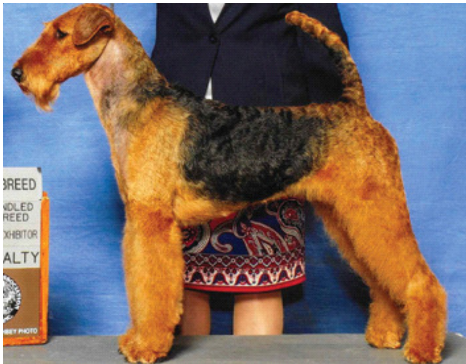
Best of Breed CH BOBCAT STELLALUNA