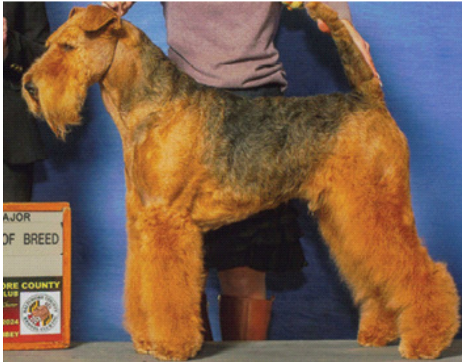
Winners Dog TIERRA FOLLOW YOUR HEART SWN RATN CGC TKN